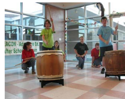
The Middle School Taiko Kids perform for an appreciative audience