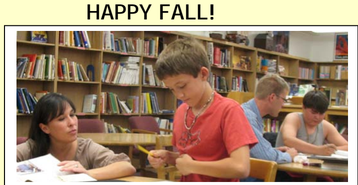
Adventure Ed Tutors help students during Homework Club.