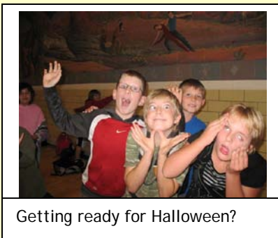
Getting ready for Halloween?

BEACON serves over 650 students each year